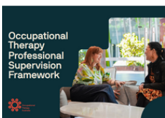
OTA Professional Supervision Framework (2025).